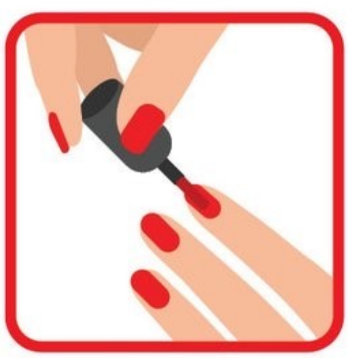
Nail salons and spas