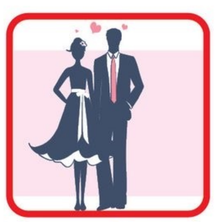
Proms, Formals and other similar events