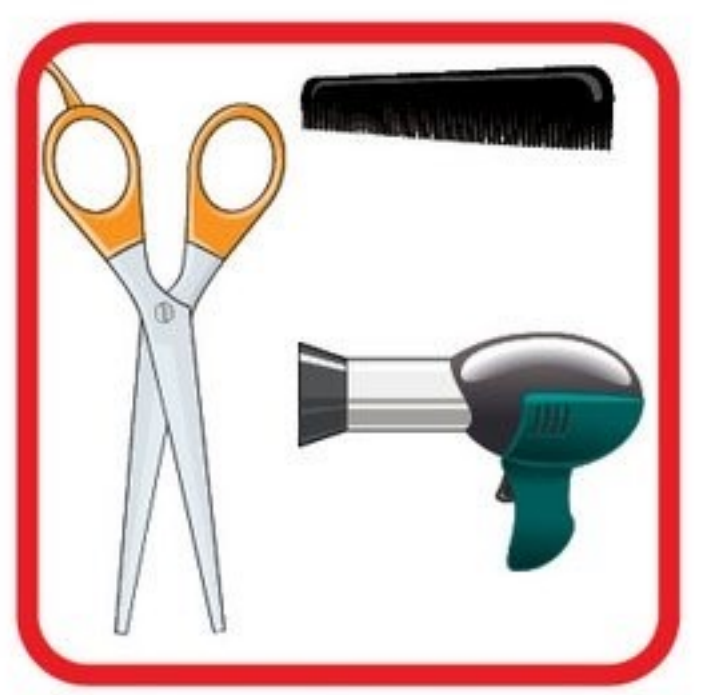
Barber shops, hair salons, waxing salons, and threading salons