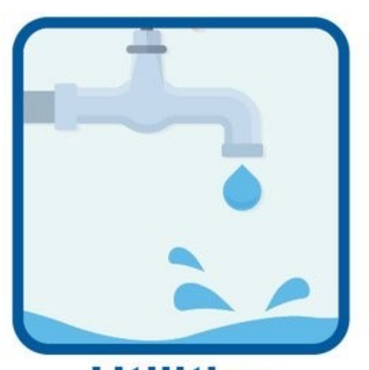
Utilities (water, gas, electricity)