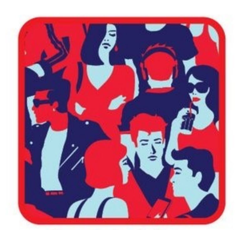
Social clubs, Fraternity and Sorority meetings and events