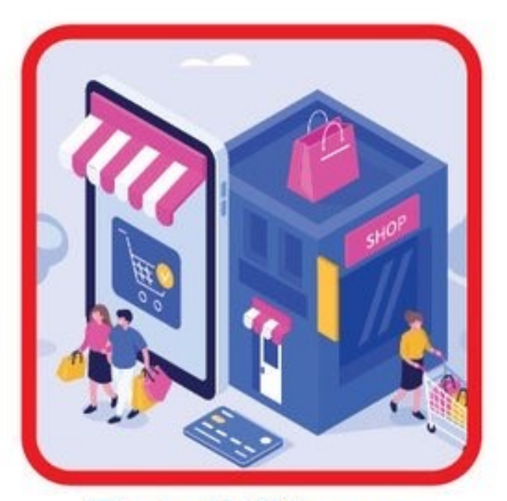
Retail Stores *See Order for more details

If you have specific questions that absolutely require a response, please contact a JCDH representative 205.930.1230 or 205.930.1260, Monday – Friday, 8am-4:30pm. We ask for your patience as call wait times may be longer than usual.