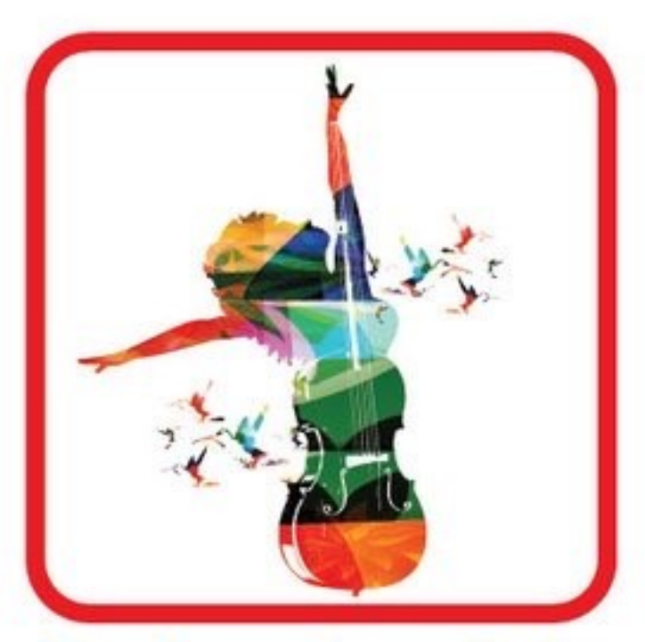
Performing Arts centers, events, rehearsals