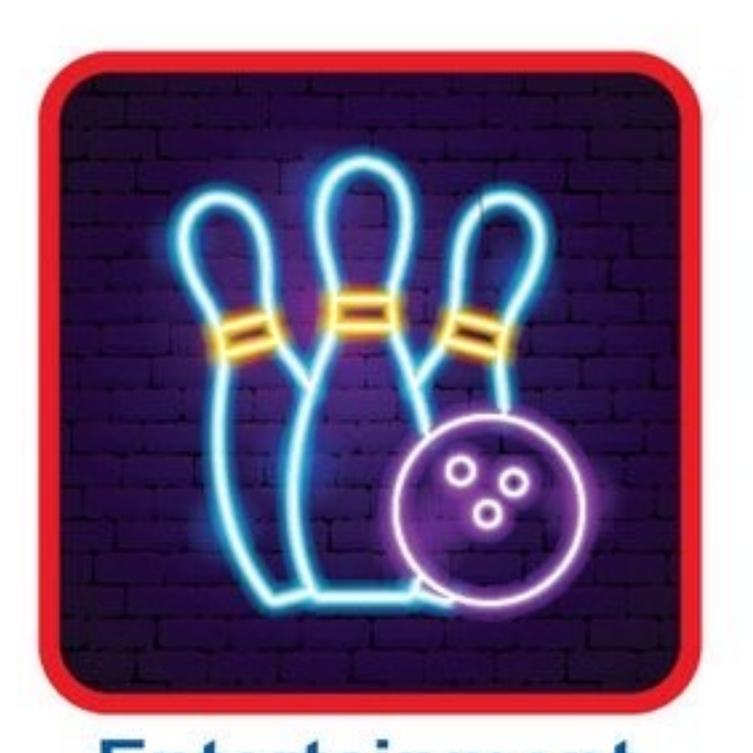
Entertainment venues *See Order for more details