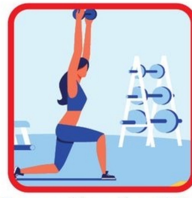
Recreation facilities and activities *See Order for more details