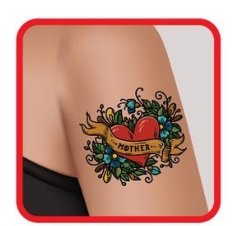
Body art facilities, and tattoo services