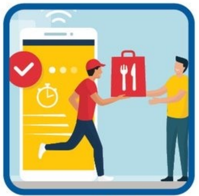
Restaurant take-out, curbside pickup, drive-thru, and delivery only

If you have specific questions that absolutely require a response, please contact a JCDH representative 205.930.1230 or 205.930.1260, Monday – Friday, 8am-4:30pm. We ask for your patience as call wait times may be longer than usual.