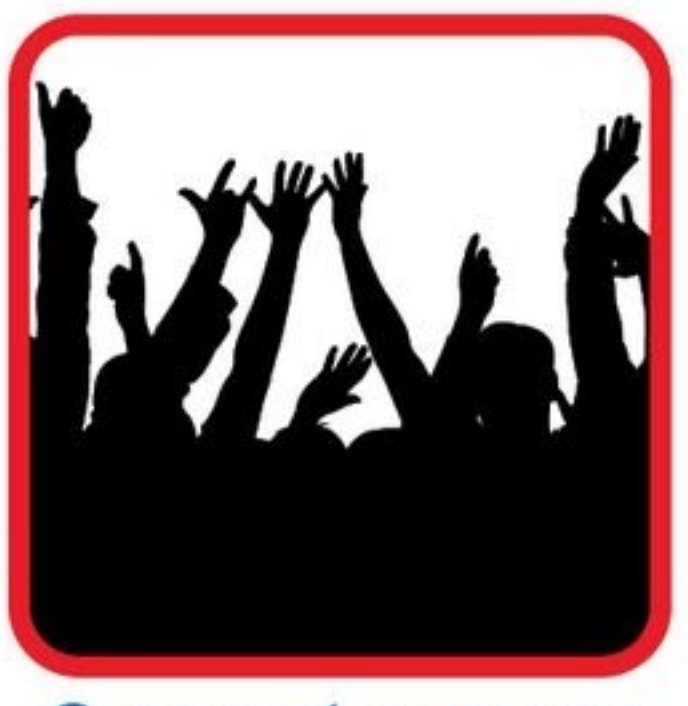
Concert venues and auditoriums