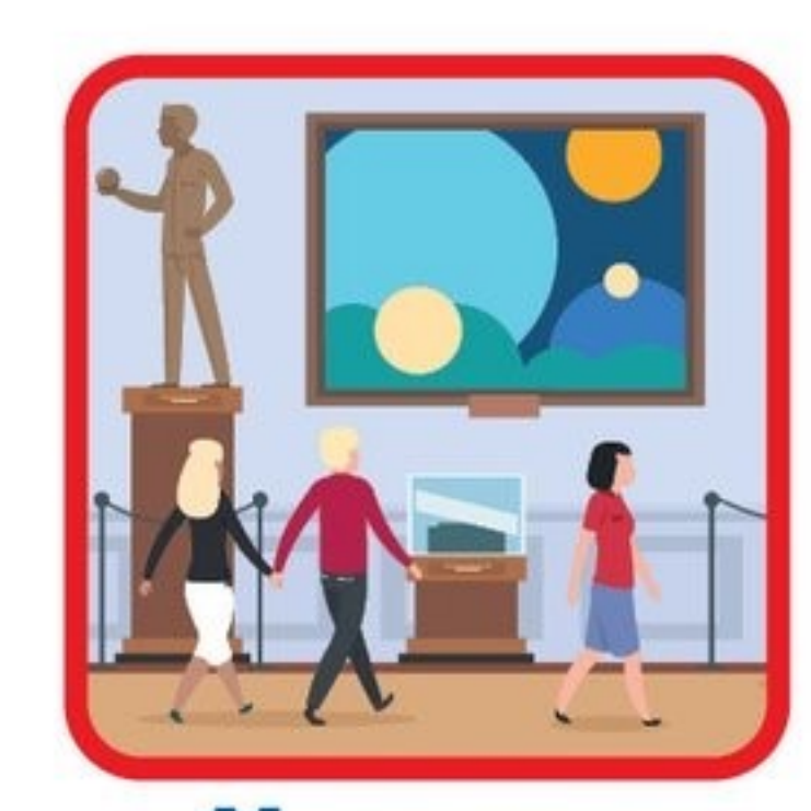
Museums, Historical sites and Galleries